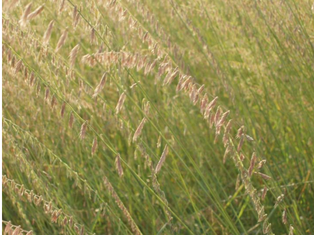
Figure 1. El Reno sideoats grama inflorescences in flower.

A Conservation Plant Release by USDA NRCS Manhattan Plant Materials Center, Manhattan, KS